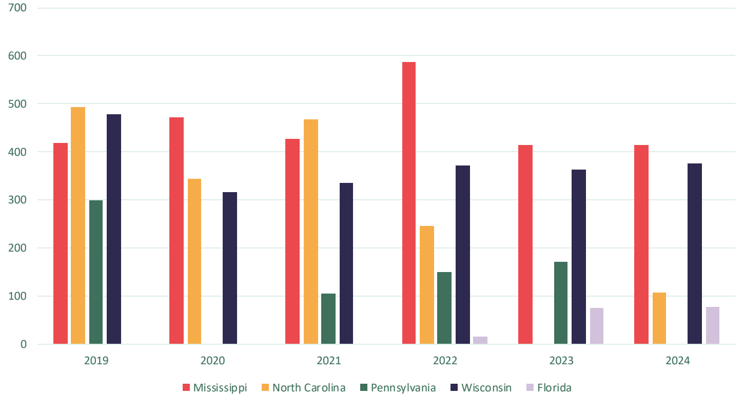
Ashley's Angels Total Children Per Year